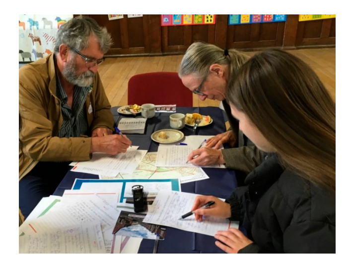
Figure 2. Participants developing ideas in the 'group passing' activity.

Data collection in the workshop comprised ideas written by participants on the templates provided (see Figure 1 for example data). All data were stored in a locked filing cabinet within an access controlled workspace. The workshop activities generated an extensive list of ideas and suggestions for facilitating social interaction within the immediate local area. Each group wrote down every idea that resulted from the activities they completed. After the workshop, we combined these ideas into one longer list and grouped and organised them under three overarching themes and 12 sub-themes that captured the overall range, content and types of ideas [37]. Themes and sub-themes were developed by two researchers (JL, TS) and then discussed with all members of the research team.