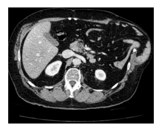
Figure 2. CT-scan, axial section: loss of integrity of the left abdominal wall with herniated bowels (left colic flexure)

of the wound in the upper left region because of the presence of loss of substance due to the penetrating trauma.