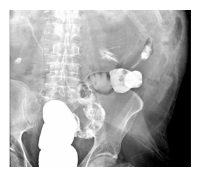
Figure 3. Colo-cutaneous fistula in the left upper abdominal region displayed after the trans-anal retrograde injection of opaque enema