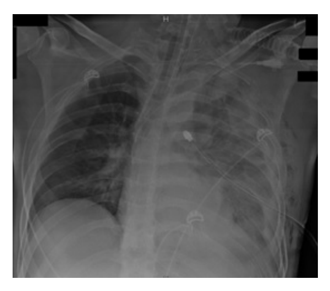
Figure 5. Post-operative day 1 after diaphragm reparation, chest X-ray shows the fluid collection occupying the left pleural cavity and collapsing the lung

The patient was discharged on 37th post-operative day from intensive care unit and he was transferred to a rehabilitation facility for a complete functional and respiratory recovery that he finally achieved after a month.