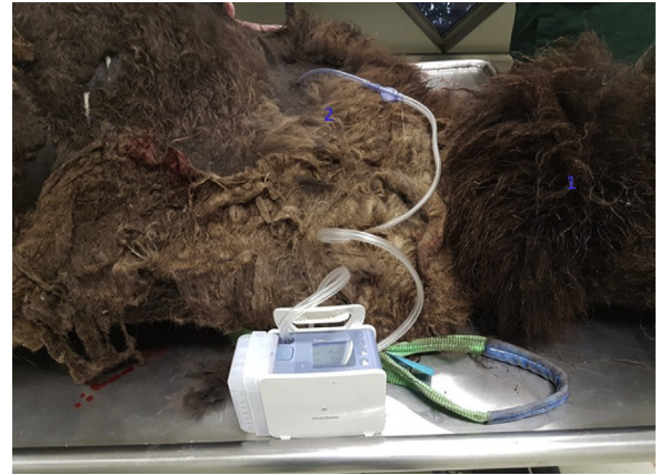
Figure 2 – Failed drainage of fluid in the contralateral pleural cavity after suction with a digital drainage system. 1 Cranial side of the animal. 2 Chest tube present in the left pleural cavity.

Just like in some other mammal species and the North American bison, an idiopathic cause of interpleural communication can occur in humans. Although some articles state this action must be caused by a congenital abnormality, 3,5-7,11,16,20-25,27-30,32,33,35,37-40 little is known about the embryologic development of the lungs and pleurae. Most of our knowledge on human development is based on the work of early embryologists, often published more than a century ago, and is established on embryologic studies in mouse models. 42 The pleural, peritoneal, and pericardial cavities all derive from the intra-embryonic coelom. This primitive body cavity develops in the primitive mesodermal layer of the embryo. 43 Closure of the pericardial-peritoneal canals starts during Carnegie stage