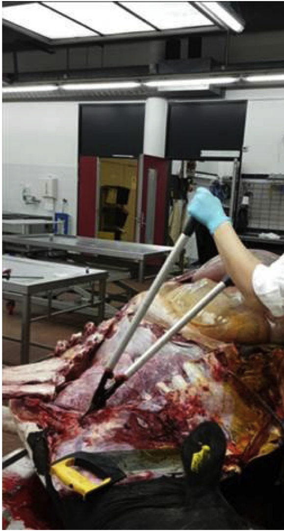
Figure 1 – Autopsy on a Dutch cow.