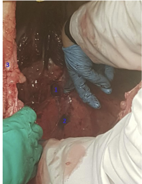
Figure 5 – Fenestrations in the posterior mediastinum of a North American bison, with the animal in a head-down position with the lungs pushed aside. 1 Fenestrations. 2 Lung. 3 Sternum.

In Thurlbeck's Pathology of the Lung , it is stated that apoptosis has been observed in all stages of lung development. 42 Although its role and regulation are not well understood, apoptosis probably is the key player in fetal lung development. This could also be a plausible explanation for a congenital buffalo chest. Jacobi et al 23 hypothesized that disruption of the mediastinal pleura from lung metastasis is another possible explanation for developing an interpleural communication.