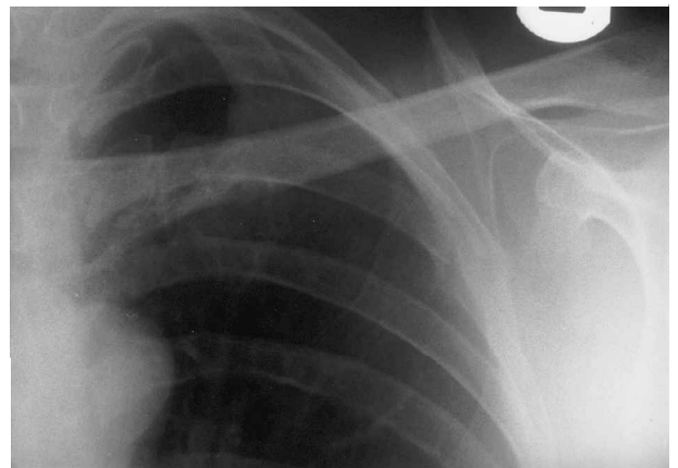
Fig. 2. Radiograph of ribs demonstrating destructive osteolytic lesions affecting ribs 3 and 4.

Ewing's sarcoma is a highly malignant round-cell tumour of bone that occurs most commonly between the ages of 10 and 25 years. Presentation over the age of 30 years, as in our patient, is extremely rare and is associated with a poor prognosis. 1 The pelvis is the most commonly affected site 2 and carries an especially poor prognosis with high rates of both local recurrence and distant metastases. 1–4 Surgical resection in combination with chemotherapy has improved the prognosis of pelvic Ewing's sarcoma, 1–4 but the outlook remains poor in those patients who develop skeletal metastases. Of the seven patients over the age of 20 years managed at UCLA, 3 who developed bone