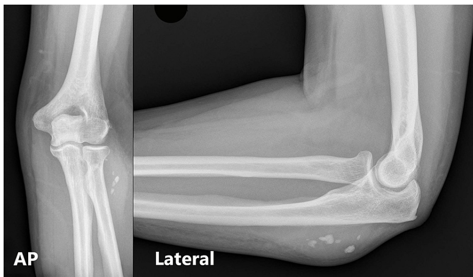
FIGURE 1: X-rays of the elbow on initial presentation with 'foreign bodies' present