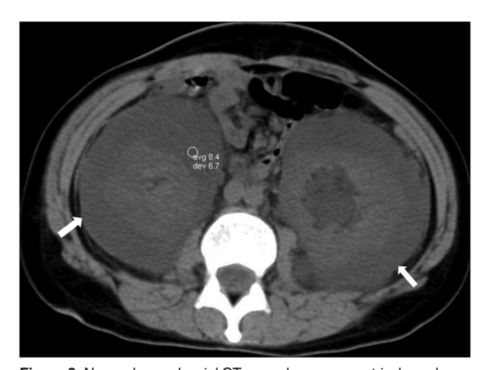
Figure 2: Non-enhanced, axial CT scan shows symmetric, hypodense perirenal collections (arrows) with an average Hounsfield value of 8

normal excretion, but splayed pelvi-calyceal systems [Figure 4] due to the intervening fluid within the sinuses. No invasion of the pelvi-calyceal systems was noted and no extravasation of contrast into the perirenal collections was seen.