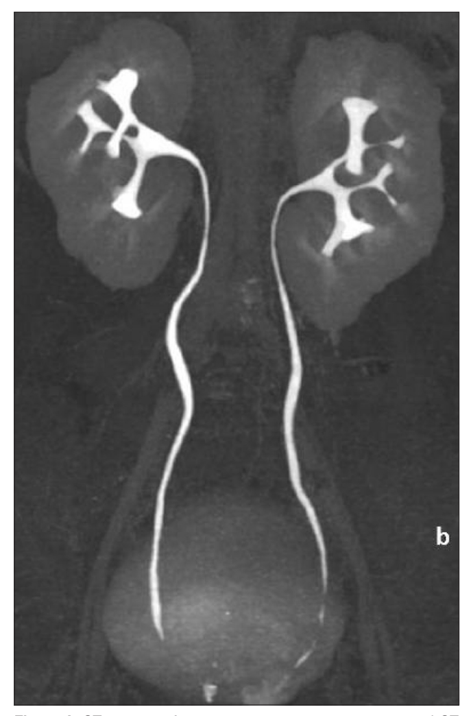
Figure 4: CT urogram. A maximum intensity projection, coronal CT scan image shows splayed and non-dilated excreting collecting systems

These findings were considered suggestive of of perirenal lymphangiomatosis.