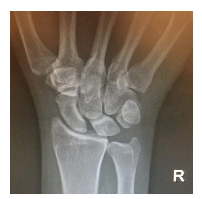
Figure 3 "Terry Thomas" sign on a wrist PA radiograph showing scapholunate diastasis.

Computed tomography (CT) scanning is a useful modality for imaging wrist pathology. For the wrist, it is best to obtain CT imaging along the axis of the scaphoid, and it is best to obtain 1–2 mm intervals in axial, sagittal, and coronal planes with 3D reconstruction. CT scanning can help visualize fractures as well as the geometric relationships of the carpal bones to each other. Magnetic resonance imaging (MRI) has also proven very useful in the diagnosis of SLL injuries.<sup>37,38</sup> When obtaining a wrist MRI, the patient should be prone, with their hand over their head and the wrist held in a neutral position. The wrist should be imaged in the conventional three planes in 1–2 mm intervals, and it is best to use a 3 T magnet.<sup>38</sup> With a good MRI, the fibers of the scapholunate can be seen as well as malalignment of the carpal bones. Minimal dorsal subluxation of the scaphoid in comparison to