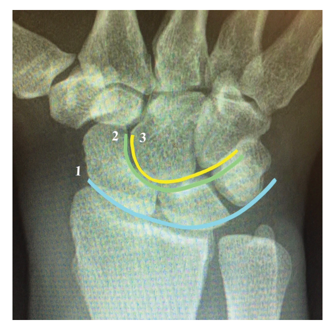
Figure 2 Uninterrupted "Gilula Lines" I, 2, and 3 in a wrist with normal alignment.

the "Terry Thomas sign" after an English comedian with a significant diastema between his front teeth (Figure 3).<sup>26,36</sup> Another radiologic finding, the "scaphoid ring sign", can sometimes be seen on the PA when the scaphoid flexes abnormally, and the scaphoid is imaged down its long axis, creating the appearance of a ring.<sup>35</sup> Both the Terry Thomas sign and scaphoid ring sign can be seen in wrists without a history of trauma. Comparison of the contralateral wrist