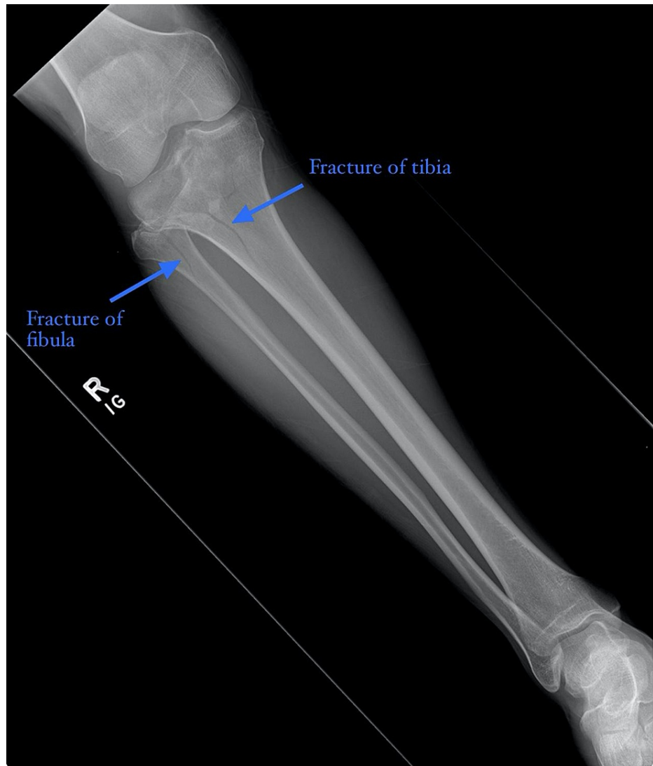
FIGURE 1: Plain radiograph of the right tibia fibula showed comminuted proximal tibial and fibular fractures (blue arrows) with evidence of intra-articular extension, right knee joint effusion, and lipohemarthrosis

X-ray of the right femur showed right tibial and fibular fractures without femoral fracture. X-ray of the right foot showed no evidence of acute fracture or dislocation. X-ray of the right tibia fibula showed comminuted proximal tibial and fibular fractures with evidence of intra-articular extension, right knee joint effusion, and lipohemarthrosis (Figure 1).