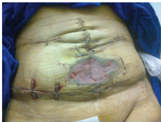
Fig. 3. Patient following steroid therapy and skin grafting.