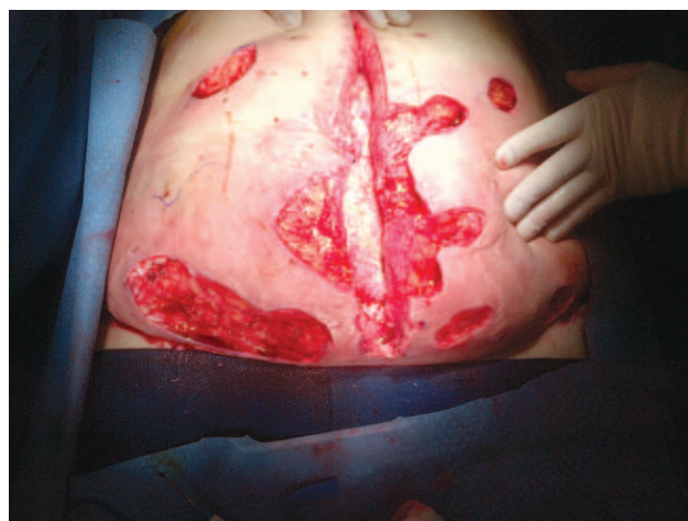
Fig. 1. The patient status post incision and drain site debridement. A large amount of erythema surrounding the wounds is also shown.

The case represents an unusual etiology of postoperative fever and wound breakdown. The presentation of PG mimics an infectious process and is often misdiagnosed. 4,5 The suggested diagnostic criteria for PG are listed in Table 1. 2 The prognosis of PG is generally favorable. 6