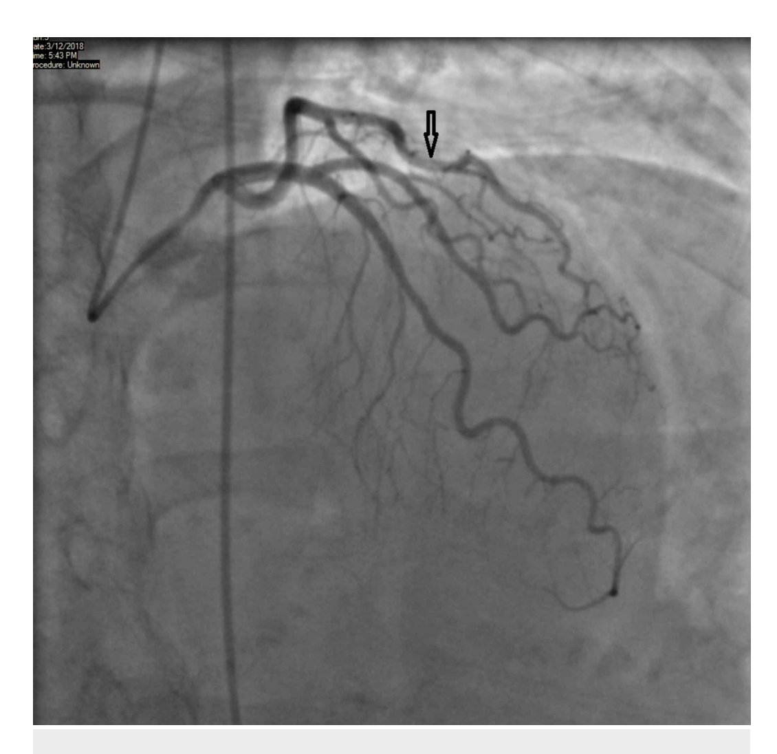
FIGURE 3: Angiography during diastole

This finding incurred a diagnosis of myocardial bridging. The patient remained asymptomatic during her course of stay and was discharged home on aspirin and metoprolol. After one month of follow-up, the patient responded well on medications.