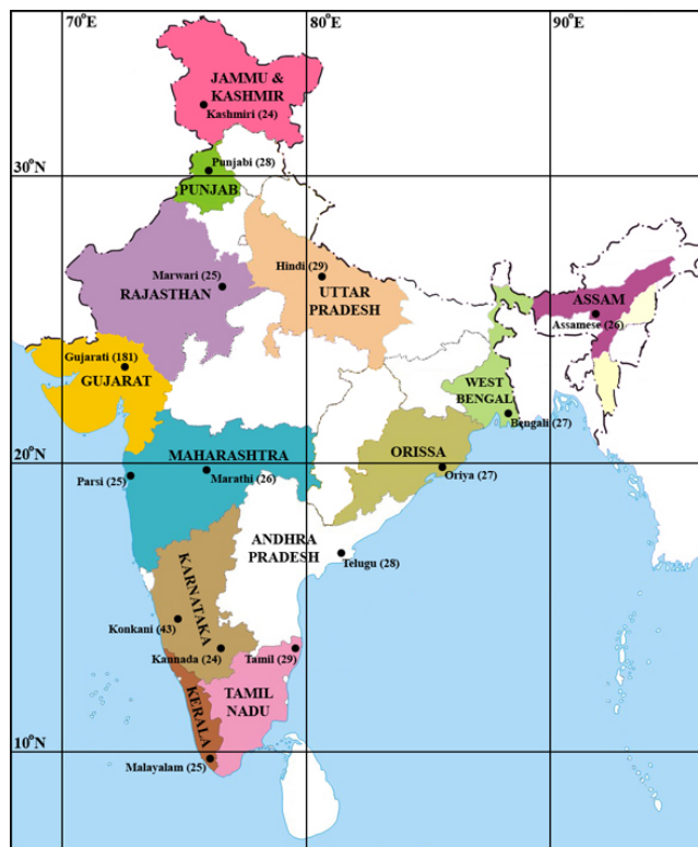
Figure 1 Sampled language groups, their sample sizes, and their geographic origins within India.