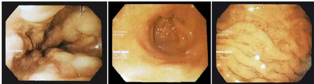
Figure 5 Esophagogastroduodenoscopy 2 months after surgery, esophageal varices grade 2 with the negative red color sign (left), cardia stomach edema (middle), and gastric snakeskin (right).

resistance to blood flow. 1,2 Patients with NCPH have proper liver function and normal liver parenchyma. 1-4 Classification and causes of NCPH are shown in Table 1. 5 PVT can occur 6–11% in cirrhotic patients, 9 but it is a rare finding in non cirrhotic patient. 3,4,9