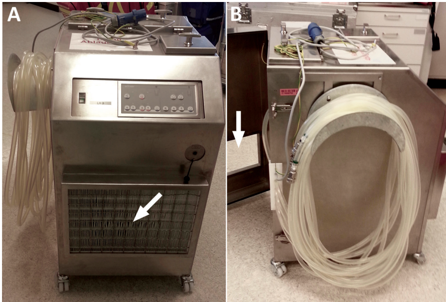
Figure 1. Custom-made stainless steel housing for heater–cooler units (model 3T; Sorin [now LivaNova, London, UK]) used at the University Hospital Zurich, Zurich, Switzerland. A) Front view shows the fine dust filter F7 over the air inlet (arrow). B) Side view shows the half-open back door with the rectangular opening (arrow), through which a duct connects the housing to the operating room ventilation exit. The negative pressure of the operating room ventilation system generates the necessary airflow.

1). These housings were directly connected to the operating room exhaust conduit.