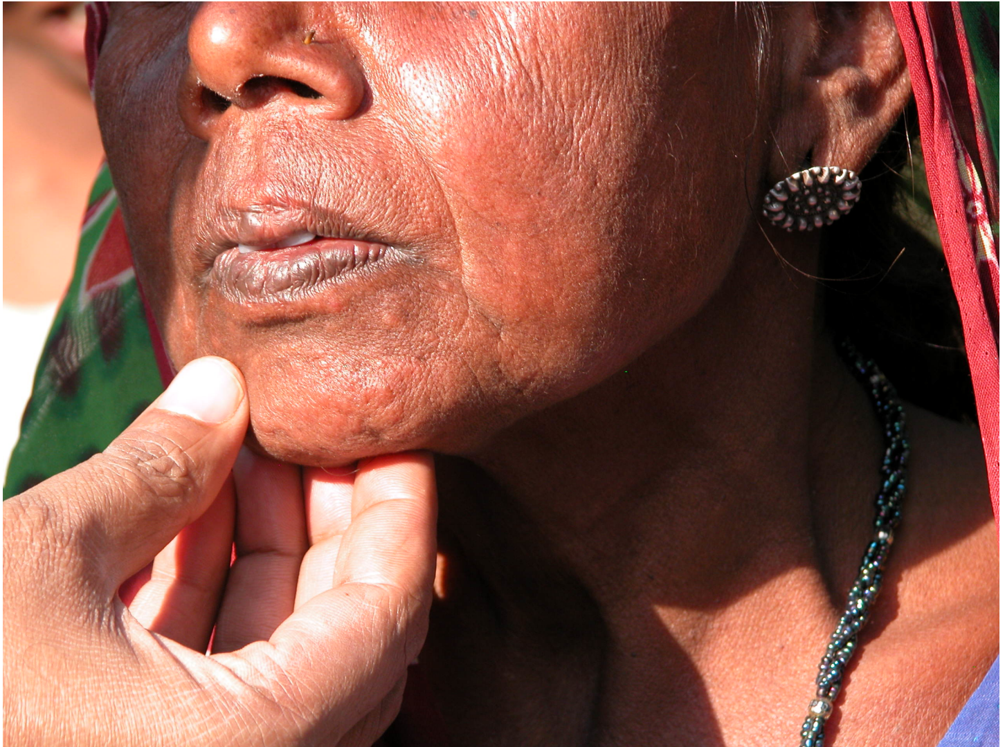
Fig 3. PKDL from India: discrete papules and infiltration of the chin, resulting in a plaque. PKDL, post-kala-azar dermal leishmaniasis.

https://doi.org/10.1371/journal.pntd.0005877.g003