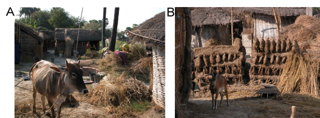
Fig 1. Endemic area for VL in India (Muzaffarpur). (A) People live in close contact with animals that may attract sand flies. (B) Typical houses with walls made of mud. VL, visceral leishmaniasis.

Stauch et al. (2011) based their VL model in the ISC on data from the KALANET trial and assumed a PKDL rate of 3% and a prevalence of 0.5 cases/10,000 [41]. Active case finding and effective short-course treatment of PKDL were recommended. Recently, similar recommendations were made, and the need to determine and quantify the infectivity of PKDL was emphasised because this may influence the impact of insecticide residual spraying (IRS) [42,43].