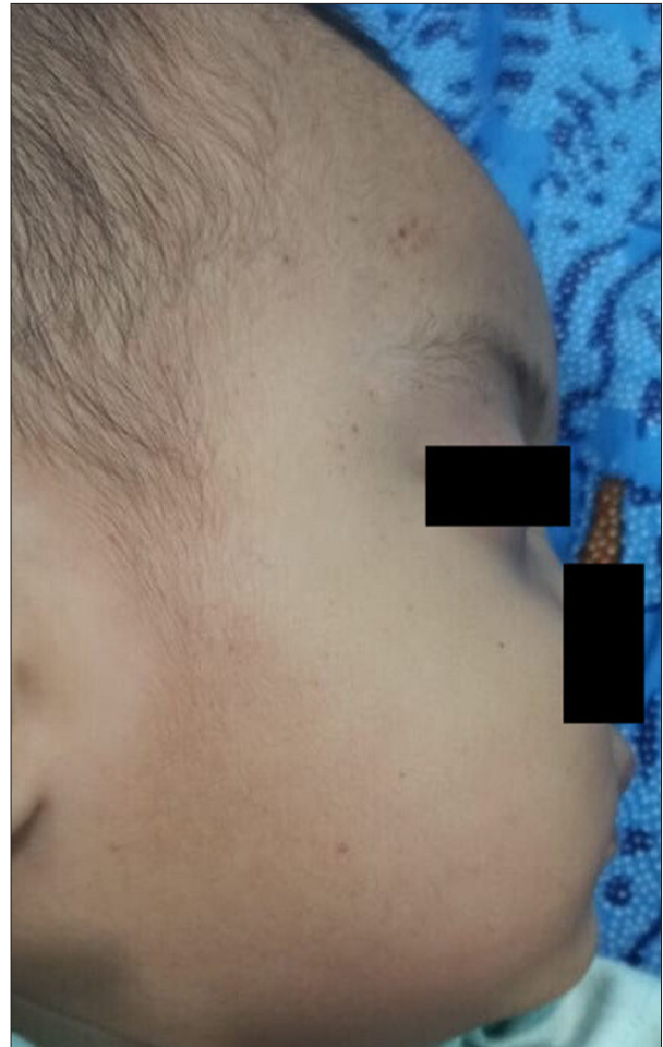
Figure 2. Chest X-ray showed mild right upper-lobe opacity.

According to the course of the disease, ITP in children is divided into 3 types: 1) newly diagnosed, with diagnosis within 3 months, accounting for 50% of cases; 2) persistent ITP, within 3 to 12 months from diagnosis, accounting for 25% of cases; and 3) chronic ITP, more than 12 months from diagnosis [7].