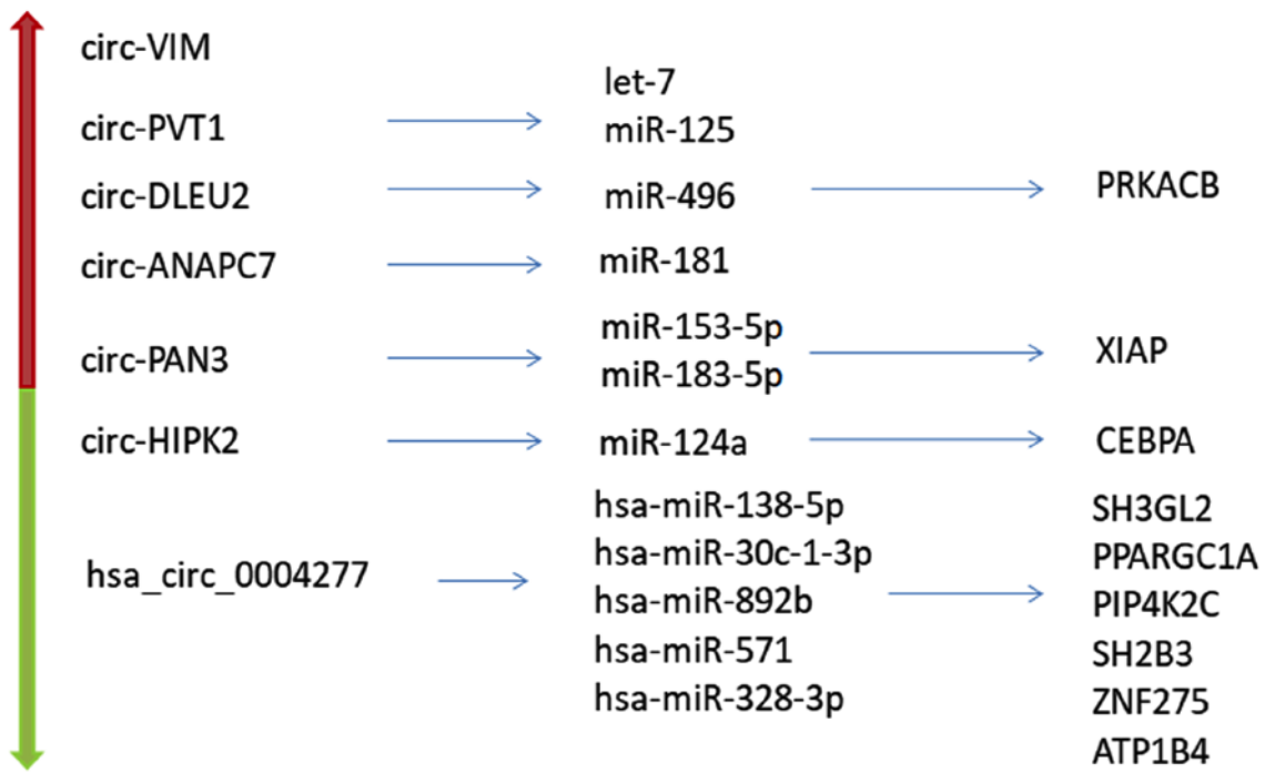
Figure 2. Summary of circular RNAs in acute myeloid leukemia. The diagram illustrates the circRNA-miRNA-mRNA axis in AML studies. The overexpression of circular RNA (circ-VIM, circ-PVT1, circ-DLEU2, circ-ANAPC7 and circ-PAN3) in AML are marked in red and the downregulation of circular RNA (circ-HIPK2 and has-circ-0004277) are marked in green.

acid receptor \alpha (PML/RAR \alpha ) fusion protein, which induces oncogenic transcription by blocking cell differentiation at the promyelocytic stage, resulting in malignant transformation (73).