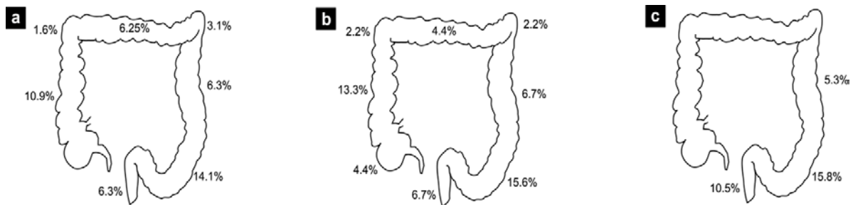
Figure 1. Percentage of patients with at least one lesion found at specific colon sites. (a) All colonoscopies. (b) Screening colonoscopies. (c) Patients under age of 50.

60 years old [26, 31], post-cholecystectomy [32] and those with characteristics of metabolic syndrome [13, 33]. The carcinogenesis mechanisms of proximal lesions may be different from those related to distal lesion, in part by an abnormal methylation of DNA causing microsatellite instability and a default in DNA repair mechanisms [31, 34]. Thus, our overall proximal lesion rate of 10.3% and the possible increased risk of proximal lesions among kidney transplant candidates provide a compelling argument for the more appropriate use of total colonoscopies in this population.