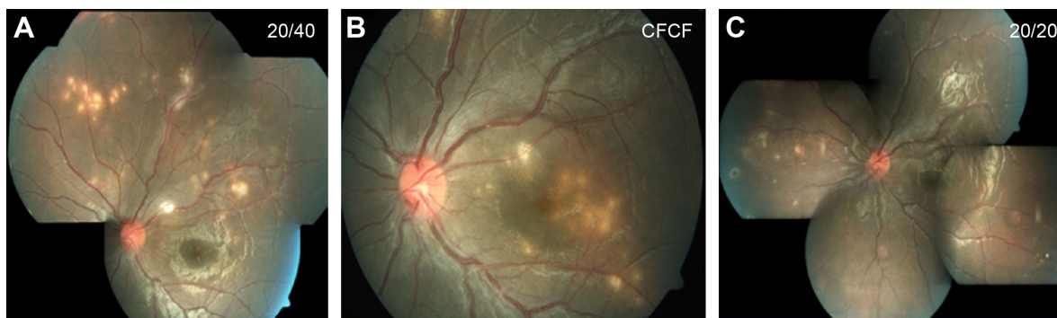
Figure 1 Fundus pictures of the left eye of an 11-year-old child who presented with blurred vision. Notes: (A) At presentation, multiple subretinal yellow–white lesions were seen superiorly and at the superotemporal periphery and treated with antitubercular drugs and oral steroids (tapered over 2 months). (B) 1 month after stopping oral steroids, recurrent crops of multiple yellow–white subretinal lesions appeared at macula, which were treated with laser photocoagulation to the inferior retina and high-dose oral albendazole therapy. (C) Complete resolution of lesions was observed at 2 months. The child remains recurrence free 2 years after treatment. Abbreviations: 20/20, Snellen visual acuity equivalent to 20/20; CFCF, visual acuity counting fingers close to face; 20/40, Snellen visual acuity equivalent to 20/40.

to larval products and immune response of host to the toxin are believed to damage the inner as well as the outer retina, hence affecting retinal nerve fiber layer (RNFL), optic nerve, and RPE, anatomically and functionally. 1,4,5,19,20