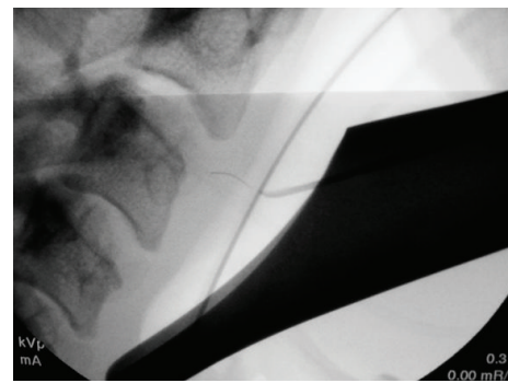
FIGURE 3: Fluoroscopy verifying position of bristle under tip of blunt probe.

The patient was intubated with a video laryngoscope to avoid pressure on the posterior pharyngeal wall, which may cause the foreign body to migrate more laterally. A 6.0 endotracheal tube was used. On intubation, a 1 cm area of erythema on the posterior pharyngeal wall was seen, without an obvious point of entry of the foreign body. A tonsil gag was attempted for exposure, but the erythema surrounding the foreign body appeared to be inferior to the level of the base of tongue. Therefore, a Lindholm laryngoscope was used for suspension due to its wide aperture. The microscope was engaged and used to visualize the erythema on the posterior hypopharyngeal wall. The C-arm fluoroscope was placed around the patient's head. The 1 cm area of erythema was palpated with a blunt metallic probe, but this was not in line with the fluoroscopic tip of the object. The blunt tipped probe was therefore moved more superiorly where there was notably less erythema but a small amount of mucosal sloughing. Given the fluoroscopic and microscopic findings,