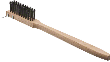
FIGURE 1: A wire bristle brush used for cleaning grills.