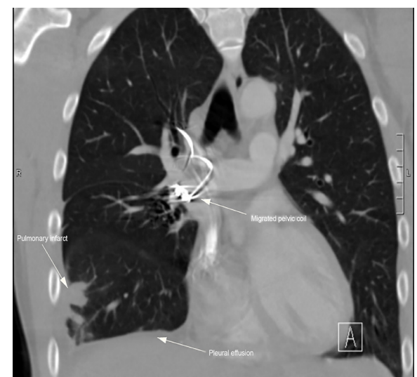
Image 2. Computed tomography imaging showing a migrated pelvic coil (mid-image arrow) in the right pulmonary artery with areas of pulmonary infarct in the right middle and lower lobes and a small right pleural effusion (left and lower arrows).

The patient was observed in the hospital overnight and went home the following day without anticoagulation or other