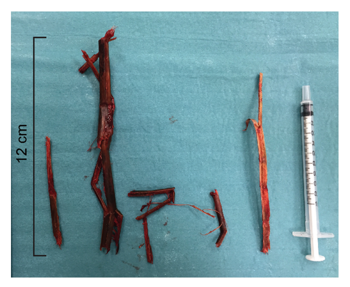
Figure 3 Five pieces of common cattail, removed through the original wound in the soft palate. The right-most piece lacks about a 2 cm bit cut for bacteria culture.