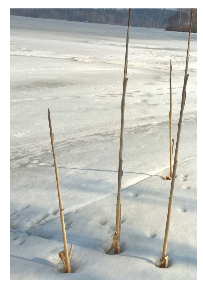
Figure 1 Scene of the accident: the left-most common cattail penetrated deep into the patient's throat (photograph taken 2 months after the accident).

such as cutting firewood with a chainsaw, the neck pain worsened considerably and the pain area swelled for several days. In addition, the patient's grandchildren repeatedly noticed a disagreeable odour emanating from the patient. Eleven months after the accident, MRIs showed a large fluid-filled cavity and a >5 cm long foreign body inside the neck muscles. Retrospectively by careful examination, that foreign body was observable in one slice of the very first unenhanced CT images, but not in subsequent CT images. After a nearly 1-year delay, a large amount of pus and a still-hard, solid piece of the cattail were removed from the neck muscles under general anaesthesia (figure 4). Bacterial and fungal cultures from the pus grew no organisms.