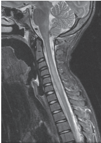
Figure 1. Sagittal section shows T2 prolongation starting in the brain stem at the level of the middle cerebellar peduncle and extending into the medulla and cervical spinal cord to the C7 level. There are ill-defined margins and no enhancement after gadolinium contrast administration.