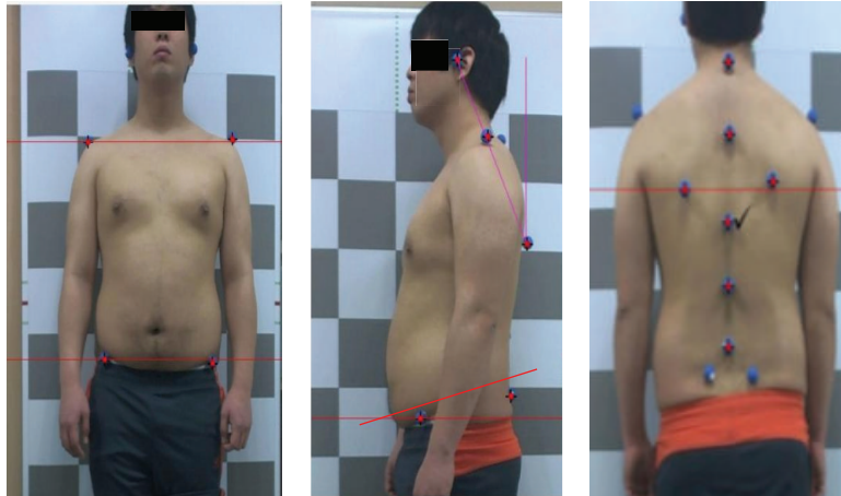
FIGURE 1: Anterior, lateral, and posterior view.

connected to the trunk. Therefore, if we consider the anatomical orientation of the muscles, there could be problems not only with thoracic kyphosis or rounder shoulder but also with other postures of a trunk such as shoulder or pelvic tilt.