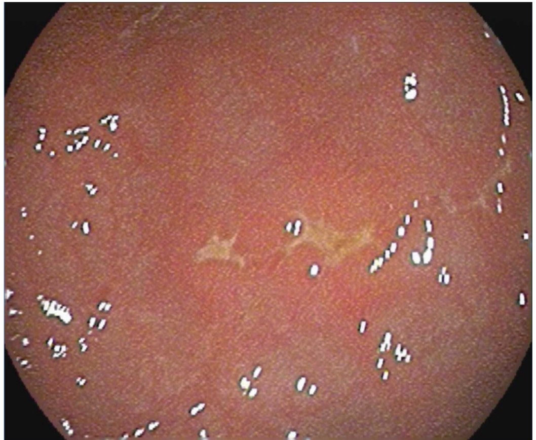
FIGURE 1: EGD showing multiple stellate gastric ulcers

Initially, feeds were withheld; intravenous fluids, empiric antibiotics, and acyclovir were administered, and a nasogastric Replogle tube was placed. The gastroenterology team was consulted and an esophagogastroduodenoscopy (EGD) was performed on the fourth DOL. The EGD showed normal esophageal mucosa, extremely friable and erythematous gastric folds, multiple superficial small ulcers without active bleeding within the antral mucosa, two stellate ulcers in the gastric body, and friable and erythematous duodenal folds without ulceration (Figures 1, 2).