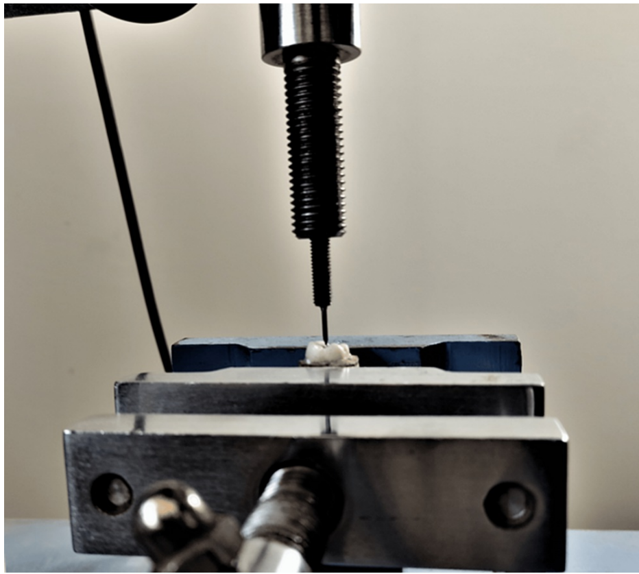
FIGURE 2: Fracture resistance test under a universal testing machine