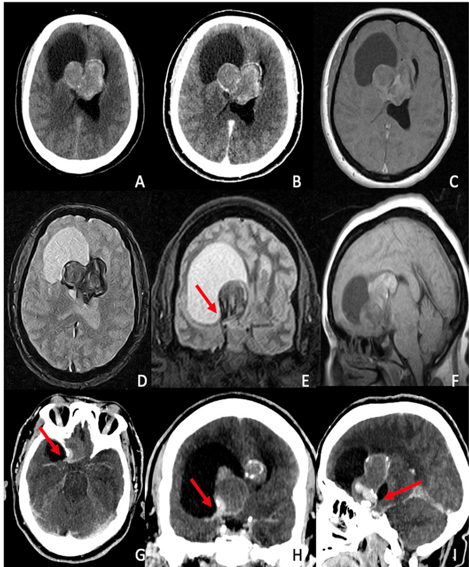
FIGURE 1: Preoperative neuroimaging assessments

A 54-year-old female patient presented to the emergency room with progressive disorientation, apathetic behavior, and bilateral lower limb weakness. She underwent a CT scan to rule out bleeding, which was followed by a contrast-enhanced CT scan when a suprasellar mass was identified. MRI showed a suprasellar heterogeneous mass with calcification areas associated with an adjacent, lateralized fluid collection. Intraoperatively, further contrasted CT reconstruction evidenced a hyperdense image within the tumor wall, continuous with the top of the right carotid artery. The radiological report suggested a craniopharyngioma (Figure 1). The patient had a clinical history of hypothyroidism, with no other hormonal or metabolic alterations in the preoperative screening.