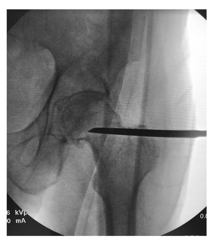
Figure 1. Intra operative fluoroscopy marking of saddle of the femoral neck.

Fluoroscopy is an essential and straight forward adjunct to the anterior total hip arthroplasty because of the patient being placed supine on the operating table [9]. When compared to the posterior approach, a DAA using fluoroscopy has been shown to more accurately restore femoral offset and leg length, as well as anteversion and abduction of the acetabular cup [10]. Marking the saddle of the femur using fluoroscopy is a simple technique that can be performed while taking the standard preoperative radiographs after