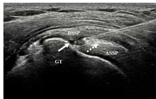
Figure 2. Ultrasonography-guided intratendinous injection. The needle tip is positioned at the intratendinous tear site (solid arrow). The injected atelocollagen spreads into the intratendinous tear gap between the bursal and articular layer of the torn rotator cuff (dotted arrow). ASSP, articular layer of supraspinatus tendon; BSSP, bursal layer of supraspinatus tendon; GT, greater tuberosity.

within the tear site of supraspinatus tendon was identified through ultrasonography (Figure 2). Group 1 patients were treated with 0.5 mL of type I atelocollagen, and group 2 patients were treated with 1 mL of type I atelocollagen. In group 3, there was no injection.