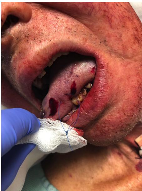
FIGURE 1 Evidence of venous congestion in the ulnar forearm free flap despite revision of the venous anastomosis

Venous congestion of the flap recurred (Figure 1) within a few hours, and the patient was brought back to the operating room for exploration and free flap revision. At this point, the ulnar flap could not be salvaged. A left lateral arm free flap was then elevated to salvage the reconstruction. Again, microvascular re-anastomosis was uneventful with end-to-side anastomosis to the left internal jugular vein. Of note, the