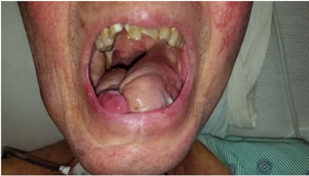
FIGURE 3 Five months postoperation

to defect. 2,7 Internal and external jugular veins are commonly used given their length and diameter allowing reach to most defects and sufficient drainage. 8 Many factors have been identified in decreasing arterial patency, such as atherosclerosis, diabetes, and smoking tobacco. Venous patency is less affected by these, but can be diminished from fibrosis and endothelial damage following radiation and surgery. 7,9 However, the effects of preoperative radiation on vasculature in head and neck free flaps are controversial. Some recent studies have found no difference in postoperative complications, including flap failure, between patients with prior head and neck radiation and those without it. 4,7,10,11 Other studies have found prior radiation or neck dissection to be independent risk factors in flap failure and serious complications. 1,5,9,12 Tall et al described how radiation causes an inflammatory response that alters the vascular biology through endothelial damage and activation of coagulation cascade. 9