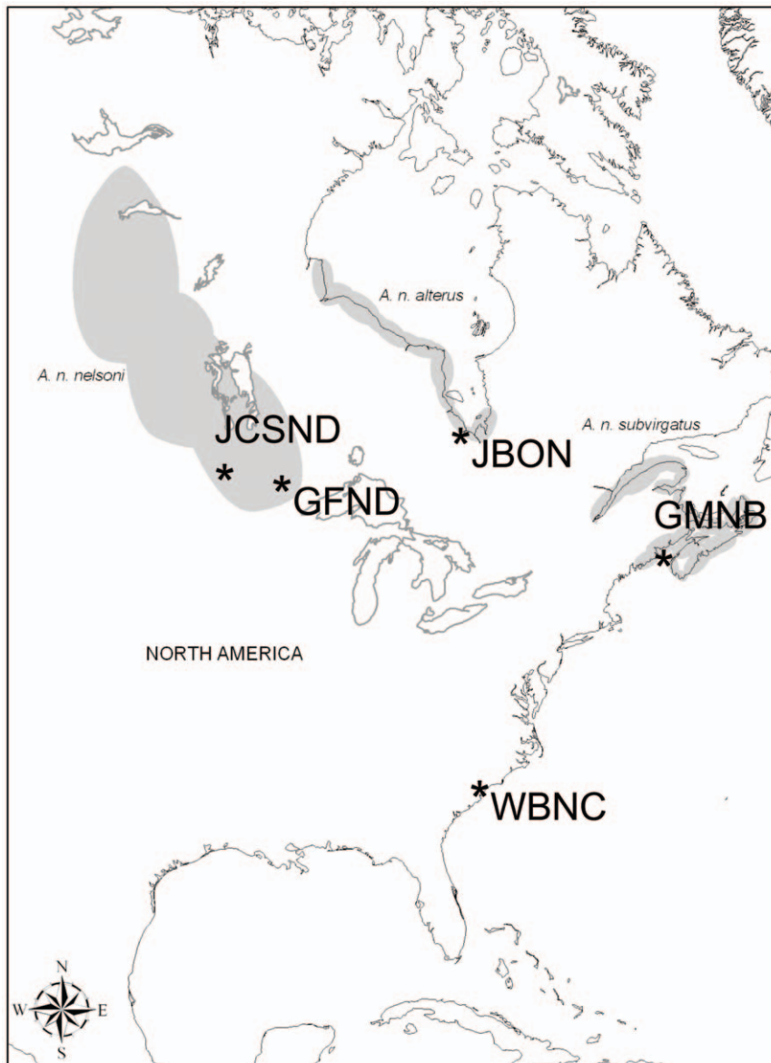
Figure 1. Map of breeding ranges (gray shading) for each subspecies of Nelson's Sparrow. Capture locations are noted with asterisks (*). GFND represents captures near Grand Forks, ND, USA (47°54'7.90"N, 97°17'55.31"W); GMNB represents captures from Grand Manan Island, New Brunswick (44°42'0.00"N, 66°47'60.00"W); JBON represents captures from the shore of James Bay north of Moosonee, Ontario, Canada (51°21'36.53"N, 80°25'27.79"W); JCSND represents captures at J. Clark Salyer National Wildlife Refuge near Upham, ND (48°37'7.04"N, 100°42'21.41"W); and WBNC represents pooled data from non-breeding captures of all three subspecies near Wrightsville Beach, NC (34°10'34.68"N, 77°50'22.26"W). [Source for subspecies ranges: http://bna.birds.cornell.edu/bna/species/719/articles/introduction doi:10.2173/. doi:10.1371/journal.pone.0032257.g001

Blood is well-suited as a biomonitoring tool for the study of mercury dynamics because it (1) allows for measurement of short-term variability in mercury uptake, (2) provides a measurement of actual contamination, and (3) reflects physiological influences such as mobilization of mercury during molt, migration, and repro-