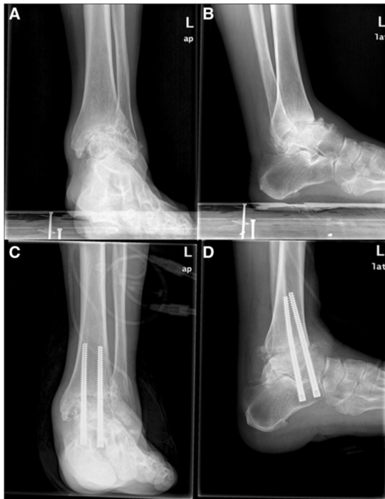
Fig. 2 Preoperative (a, b) and postoperative (c, d) radiographs after tibiototalcalcaneal arthrodesis with headless compression screws

who underwent tibiototalcalcaneal arthrodesis with headless compression screws experienced satisfactory postoperative outcomes. Jehan et al. [19] systematically reviewed 33 studies and analysed the efficacy of tibiototalcalcaneal arthrodesis with 659 intramedullary nails in 631 patients. They found that the union rate was 86.7 %, the average union