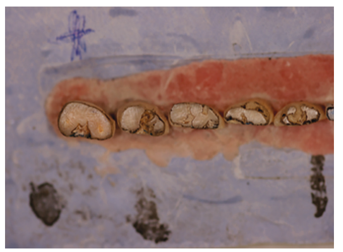
Fig. 2: "Teeth" colored by a pencil after grinding procedure