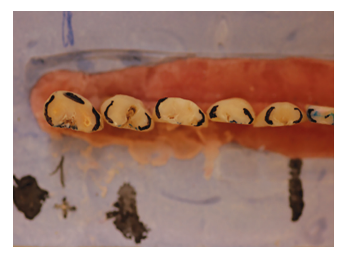
Fig. 1: "Teeth" mounted on a hard plaster stand base before grinding procedure

Group S (26 "teeth" = 52 proximal sides): The "teeth" were stripped with an abrasive metal strip (6 mm Steel Separating Strips, Becht, Germany). A back and forth movement eliminates the interproximal contact surfaces while removing the already drawn line of enamels' thickness to strip.<sup>12</sup>