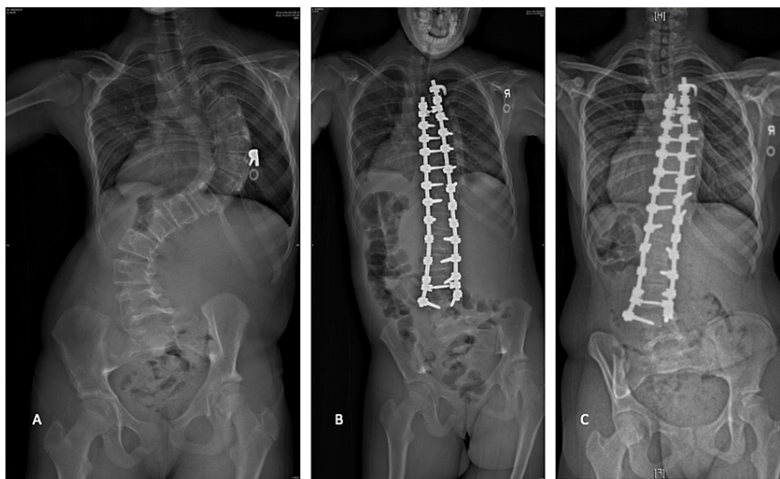
FIGURE 1: The patient diagnosed with adolescent idiopathic scoliosis showing pullout of the distal pedicle screws associated with non-union.

Within the seven complications, there was one case of lumbar pedicle screw pullout with an associated nonunion (Figure 1A-1C); one iliac screw breakage after a patient returned to activity earlier than instructed (return to activity protocol were no sporting activity at all for one year, followed by low-impact non-competitive activities for the second post-operative year); one iliac screw pullout in a patient with cerebral palsy; a single incident of rod breakage associated with non-union in a syndromic scoliosis; two incidents of hook slip without the loss of correction (Figure 2A-2D); and one crosslink fracture after a patient was treated for infantile scoliosis without clinical sequelae.