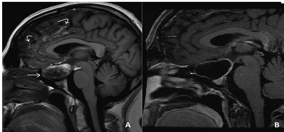
FIGURE 2: MRI sagittal views of the dermoid cyst (straight arrow) and subarachnoid sulcal cholesterol deposits (curved arrows) on non-contrast T1 (A) and fat-suppressed non-contrast T1 (B) sequences. Again, notice the deposits disappear on fat-suppressed sequencing.

She continued to have persistent headaches with migrainous features and continued cognitive complaints and paresthesias in the arms bilaterally. Her neurologic examination was normal, aside from attentional deficits. Postoperative imaging (Figure 3B, 3C) showed persistent abnormal signals in the subarachnoid space consistent with lipid particles. Her spinal cord imaging did not show any subarachnoid dermoid cyst components irritating radicular nerves as the etiology of her paresthesias. Although she refused a lumbar puncture, her headaches were attributed to persistent chemical meningitis based on clinical and imaging findings. She was managed symptomatically for headaches and paresthesias with an acceptable response.