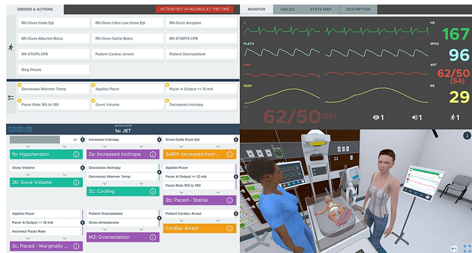
FIGURE 1: Interactive moderator display during the JET/LCOS scenario

the participant's actions along with dialogue buttons for the embedded virtual characters (Figure 1). Manual controls were used only secondarily, as the cases were designed to progress and respond to the participants' actions automatically without manual control from the moderator except when engaging in dialogue with simulated characters, or when the participant deviates substantially from the expected management strategy. The observers maintained checklists of the management objectives met by each participant. Scenarios concluded when the predetermined endpoints were met.