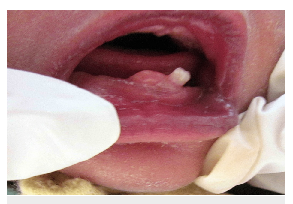
FIGURE 1: Intraoral examination showing natal tooth