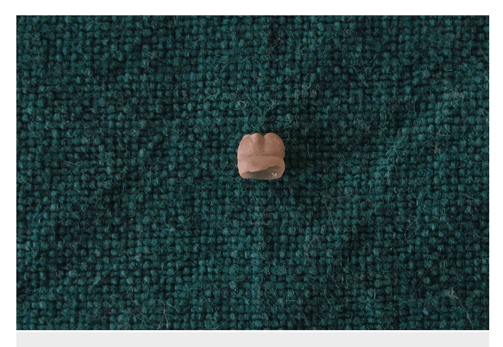
FIGURE 3: Natal tooth showing shell appearance

The child was referred for extraction of the tooth due to difficulty in feeding and the risk of aspiration. The pediatrician was consulted regarding vitamin K administration to the infant and it was found that prophylactic administration had already been done. The natal tooth was extracted under local anesthesia (lignocaine with epinephrine) using an insulin syringe. The extracted tooth had a crown but was devoid of root (Figure 3). The infant was re-evaluated after two days, and the recovery was uneventful.