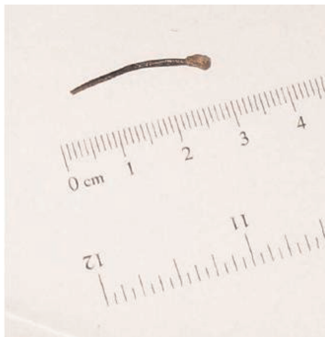
Figure 3. The foreign body removed from the abscess cavity at the time of surgery.

enabling them to arrest in the caecum and gravitate towards its dependent position [4,7]. A variety of foreign bodies have been found in the appendix ranging from sewing needles, retained shot pellets, tongue studs,