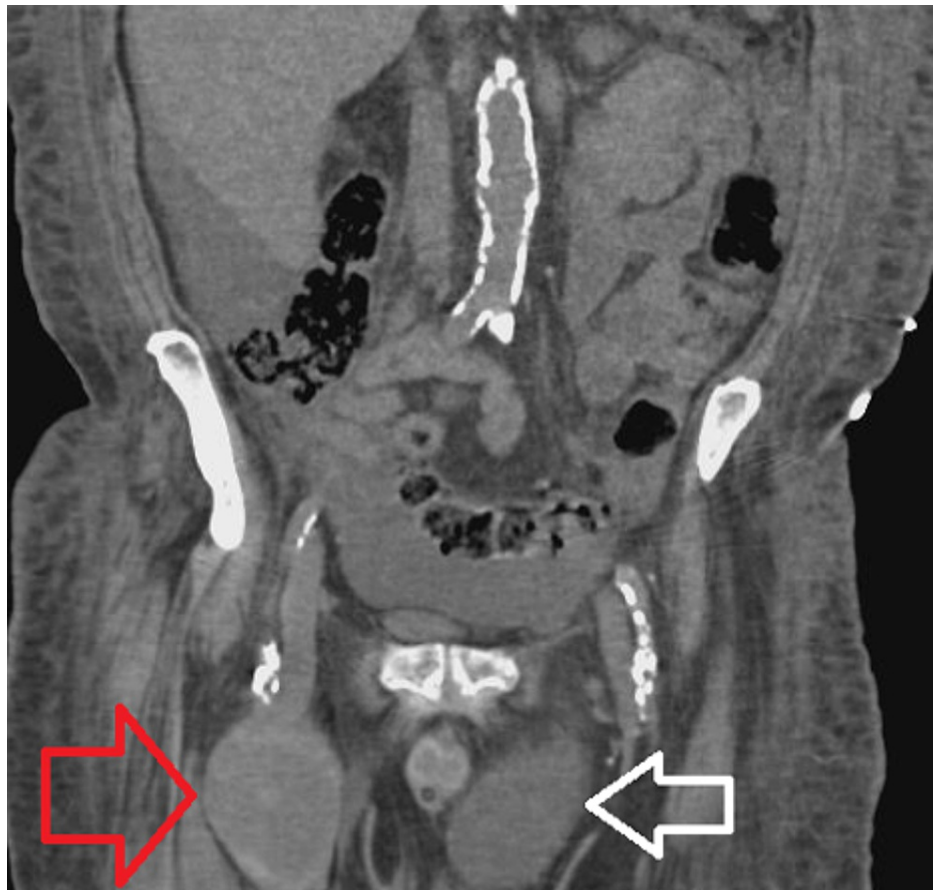
FIGURE 2: Coronal CT scan without IV contrast.

Red arrow showing the large superficial femoral pseudoaneurysm. White arrow showing the large left inguinal hernia.