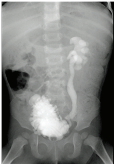
FIGURE 2: Cystogram showed a trabeculated bladder with fairly poor capacity and grade IV reflux.

had normal tendon reflexes, including the anocutaneous reflex. She had no anal stenosis or deformity. She had no constant urine leakage, but had urine dribble during emptying; however, her parents had failed to recognize this as abnormal. Other systems were clinically normal.