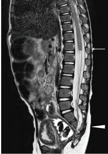
FIGURE 1: MRI showed the absence of the sacral bone under S2 and distal lumbar vertebrae (arrowhead). The level of the spinal cord terminus was situated as T-12 (arrow).