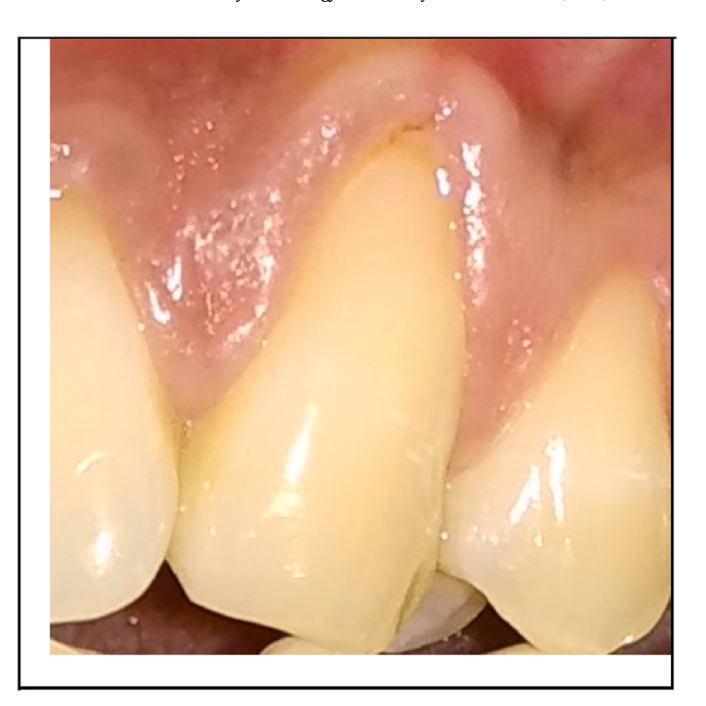
Fig. 1. Pre-operative view of test site.

Figs. 1 and 2 showed the pre-operative view of test and control sites. All the surgical procedures were carried out by a single periodontist (S. M). 0.12% chlorhexidine digluconate rinse was used before surgery, and povidone iodine solution for extra-oral antisepsis followed by the application of local anesthesia (2% Lignocaine HCl containing 1: 80,000 adrenaline). The CAF procedure proceeded with the placement of two horizontal incisions mesially and distally at the level of CEJ of the involved tooth. An intra-crevicular incision was given using no. 12 blade. Two vertical releasing incisions were extended beyond the