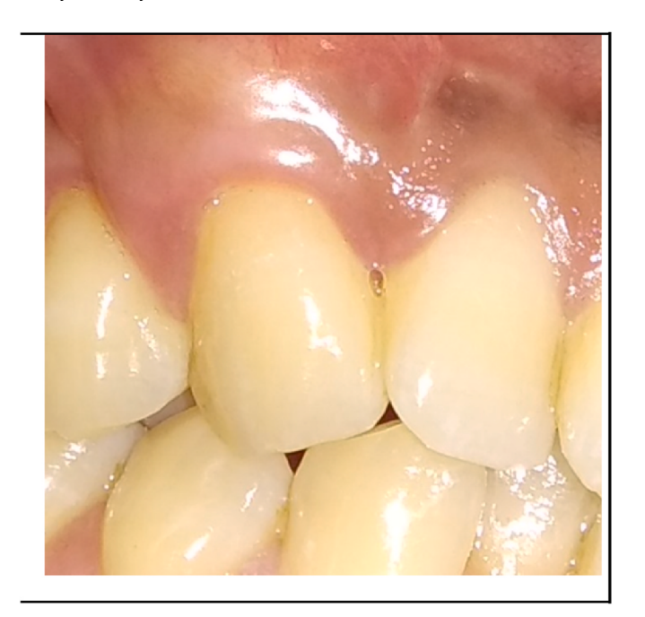
Fig. 6. 6 months postoperative view of control site.

reduction in mean PD at 3 and 6 months. The mean RD value at the test site decreased from 3.00\pm0.7 at baseline to 1.08\pm0.9 and 1.00\pm0.9 at 3 and 6 months, respectively (p =0.00). Similarly, in the control site, the mean RD value decreased from 3.33\pm0.9 at baseline to 0.58\pm0.8 and 0.42\pm0.8 at 3 and 6 months, respectively (p =0.00). Mean RW and WKG at the control sites showed the statistical significant results as compared to test site at 3 and 6 months. Both the sites showed the significant results in RAL gain and an increase in TKG.