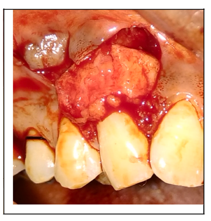
Fig. 5. 6 months postoperative view of test site.

Intragroup comparison of clinical parameters (mean \pm SD) over the 6-month experimental period is presented in Table 2. Both site showed a