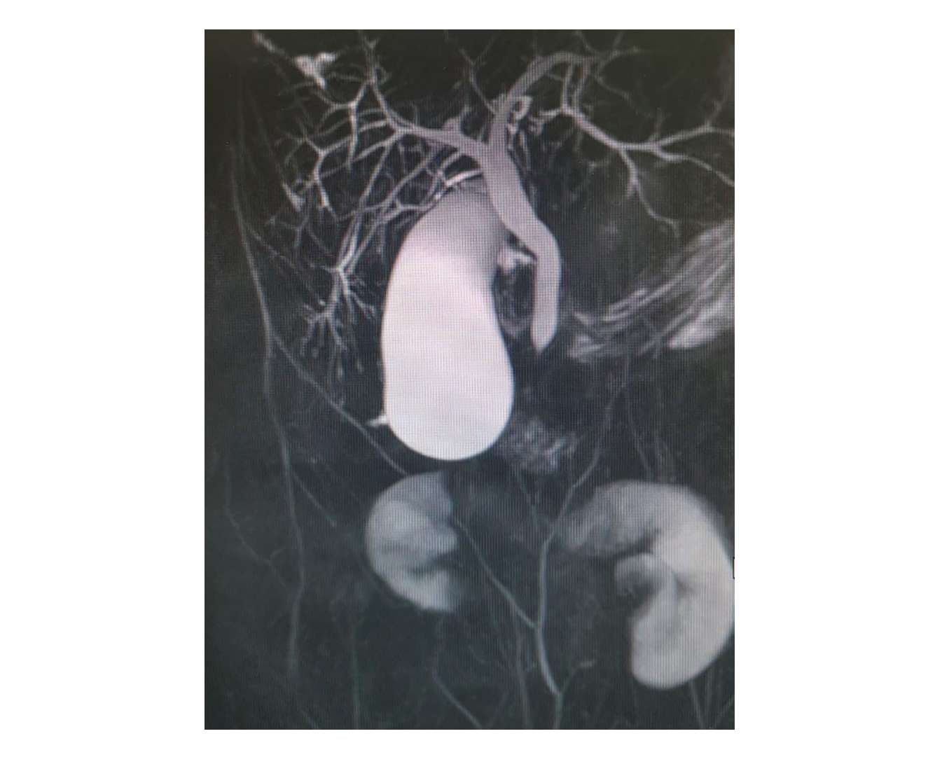
FIGURE 3 | Distended common bile duct and intrahepatic bile ducts on magnetic resonance cholangiopancreatography (MRCP).

patients in the literature shows that none of the reported adult or juvenile hypomyopathic DM patients, despite of laboratory (abnormal CK), electrophysiological (abnormal EMG) and/or radiologic (MRI) evidence of myositis, developed clinically significant myositis during a mean follow-up exceeding 5 years (15–18). Therefore, the presence of subclinical myositis is not predictive of a future clinically significant myositis.