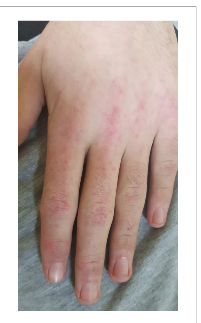
FIGURE 1 | Characteristic cutaneous features of DM called Gottron's papules (multiple erythematous papules over the dorsal aspect of metacarpophalangeal and interphalangeal joints).

fever, myalgia or weight loss. Physical examination revealed characteristic cutaneous features of DM including Gottron's papules (multiple erythematous papules over the dorsal aspect of metacarpophalangeal and interphalangeal joints, Figure 1 ), Gottron's sign (violaceus macules over extensor surfaces of elbows and medial malleoli), heliotrope rash (violaceous erythema of the eyelids or periorbital skin) and the malar rash, including the nose bridge ( Figure 2 ). The rest of the physical