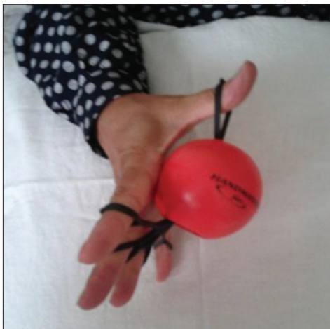
Figure 1: Hand exercise with ball