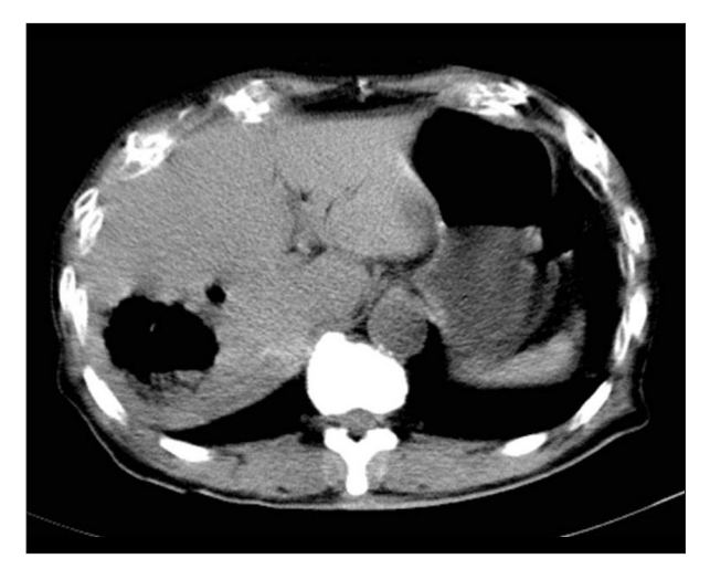
Figure 1. Abdominal computed tomography shows a gasfilled abscess in the left lobe of the liver, as well as emphysematous cholecystitis and pneumobilia.

This study was conducted in conformity with the Declaration of Helsinki. An 82-year-old man with a history of diabetes presented to the emergency room of a local hospital. He complained of nausea, low-grade fever, and restlessness for 8 h, with no diarrhea. On examination, the patient had a pulse rate of 120/min, respiration rate of 30/min, temperature of 37.7°C, oxygen saturation of 93% on room air (pulse oximetry), and blood pressure of 180/78 mmHg. A general physical examination revealed no abnormalities. The first blood sample showed hemolysis, which was initially thought to be due to an error during collection. Laboratory data revealed a hemoglobin of 8.3 g/dl, mean corpuscular volume (MCV) of 58, platelet count of 76 000/mm<sup>3</sup>, white blood cell count of 30 140/mm<sup>3</sup>, LDH of 10 321 IU/l, AST of 1366 IU/l, total bilirubin of 9 mg/dl, creatinine of 2.28 mg/dl, CRP of 20 mg/dl, serum glucose of 354 mg/dl, Na of 129 mmol/l, and K of 6.7 mmol/l. Plasma and urine were both dark red, suggesting massive hemolysis. The electrocardiogram and chest X-ray film were unremarkable. Computed tomography of the abdomen showed an abscess with gas in the left lobe of the liver and emphysematous