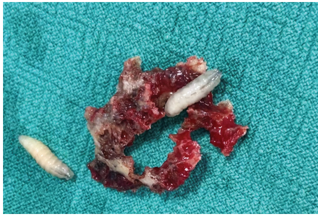
Fig. 3 The eroded bone was debrided in surgery.

the wound for the maggots to come out of the wound site. They were then handpicked using a forceps and around 25 to 30 maggots were removed. The osteomyelitic calvarial bone was debrided (►Fig. 3). The maggots were live and motile. Attendants were shown the organisms.