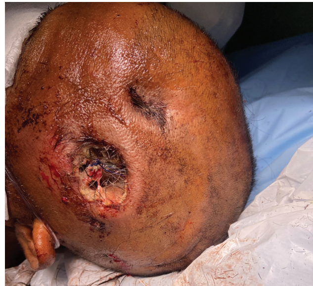
Fig. 1 A large temporal cranial lesion with exposed brain and severe maggot infestation.

Physical examination revealed left temporal scalp and cranial calvarium erosion (4 cm × 5 cm; ► Fig. 1 ). The edges of the skin were hypertrophied and erythematous with eroded frontal dura, exposed cortex, and massive cortical maggot infestation. A cluster of approximately 20 to 30 motile maggots was found at the center of the defect with apparent