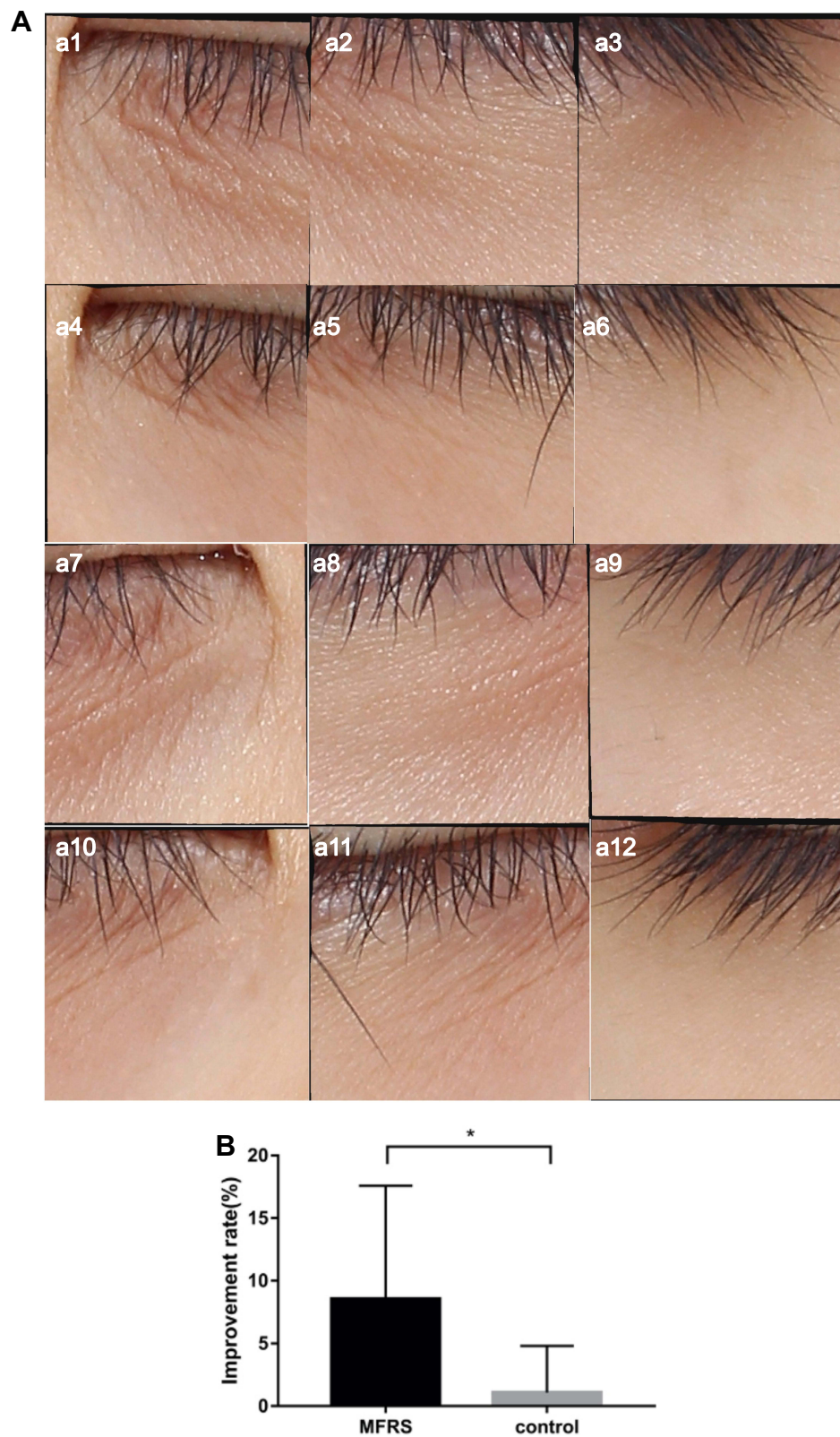
Figure 3 Improvement of periorbital wrinkles. (A) VISIA-CR images showing the improvement of periorbital wrinkles through 3-dimensional visual analysis. a1-a6: MFR-treated side, a7-a12: control side. (1–3, 7–9, baseline; 4–6, 10–12, after treatment). (B) Quantificational comparison based on VISIA results showed significant improvement on the rate of wrinkles of MFR-treated side (* p < 0.05 ).