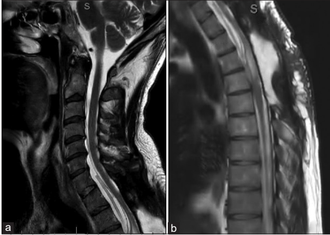
Figure 3: (a) Postoperative sagittal T2-weighted MRI cervical spine revealed improved central stenosis, decreased size of meningeal cyst with shunt catheter in place. (b) Postoperative sagittal T2-weighted MRI thoracic spine showed similar findings.

that a small defect, either congenital or traumatic, results in a cleft in the inner layer of the dura with the outer layer remaining intact. CSF fills the resultant “potential space” between the inner and outer dural layers. Hydrostatic dissection by CSF pulsations subsequently enlarges this potential space and forms a meningeal cyst. [4,6] In this patient’s case, the snowmobile accident likely caused the formation of the spinal meningeal cyst.