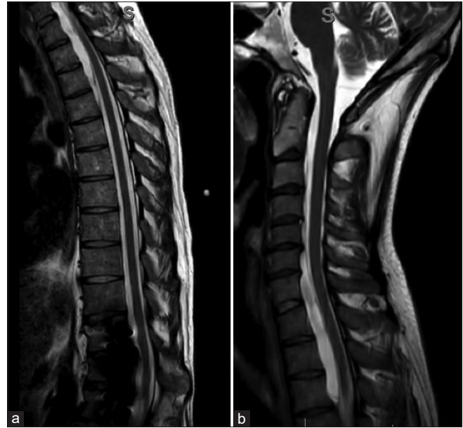
Figure 1: (a) Pre-operative imaging sagittal T2-weighted magnetic resonance image (MRI) of the thoracolumbar spine revealed a large ventral extra-axial cystic lesion causing spinal canal stenosis worst at T1-3. (b) Preoperative imaging sagittal T2-weighted MRI of the cervicothoracic spine revealed the cystic lesion extends to C2 level.

Post-operatively, the patient had improvements in his symptoms over the next 3 days and was discharged.