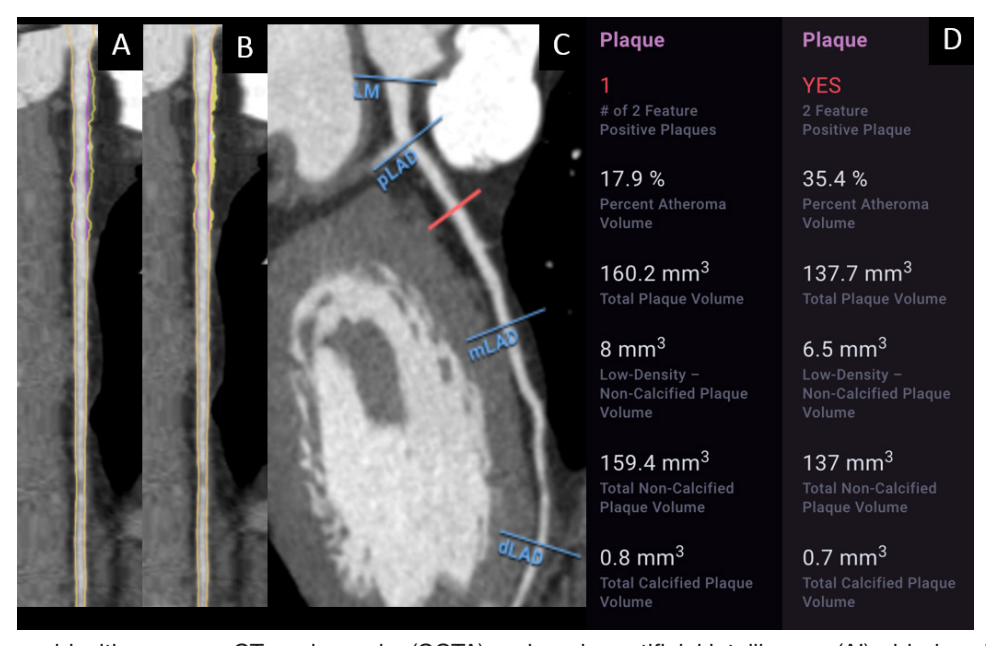
Figure 2 A 55-year-old with coronary CT angiography (CCTA) undergoing artificial intelligence (Al)-aided evaluation of stenosis and quantitative atherosclerosis burden. The patient demonstrates left anterior descending coronary artery non-obstructive stenosis (25%) with a burden of plaque (160.2 mm³) consisting predominantly of non-calcified (159.4 mm³) that includes non-negligible low-density non-calcified plaque (8 mm³). (A) shows a CCTA straight reformat with plaque identified, while (B) shows a straight reformat with a colour overlay of non-calcified plaque (yellow). (C) shows a curved multiplanar reformat. (D) shows a graphical output of the quantified plaque volume by Al-aided evaluation. dLAD, distal left anterior descending; LM, left main; mLAD, mid left anterior descending; pLAD, proximal left anterior descending.

► Vascular remodelling: Arterial remodelling was calculated by examining the lesion diameter divided by the normal reference diameter. PR was defined as a ratio