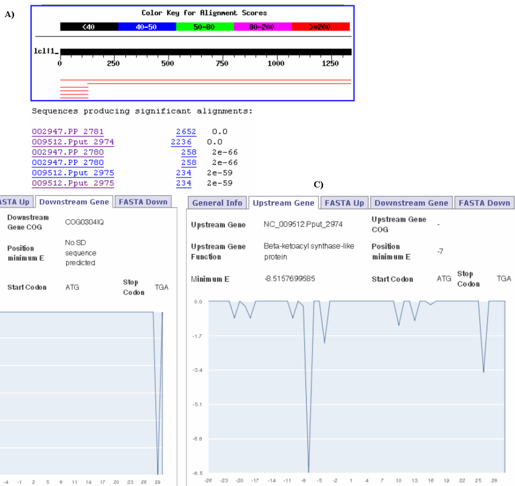
Figure 3 Study of a 130 bps incorrectly annotated overlap. The BLAST results show that the gene NC_002947.PP_2781 of P. putida KT2440 is longer than its orthologous gene NC_009512.Pput_2974 in P. putida FI (A). This difference in length indicates that the 130 bps overlap between NC_002947.PP_2780 and NC_002947.PP_2781 is not conserved and thus not reliable. In the NC_002947.PP_2781 Downstream Gene label is shown that this gene has no SD sequence (B), while in the NC_009512.Pput_2974 upstream gene label is shown that this gene has the SD sequence at 7 nucleotides to the start codon (C).

genes randomly selected ( 69.04\% \pm 2.58\% ) (Table 1). Therefore, as other authors have already found [10], the HEGs appear to have more SD presence. Another interesting gene set that can be analysed in this database is the horizontally transferred genes (HGTs). We studied the SD presence among the E. coli K12 genes predicted as HGTs in the HGT database [40]. The percentage of HGTs that have SD sequence (68.39%) is close to the percentage of SD presence found in all the E. coli K12 genes. This percentage falls within the range of the mean and the standard deviation of 100 sets of 300 genes randomly selected from E. coli K12 (Table 1). Therefore, it seems that the HGTs have an equal SD presence to the original genes of the species.