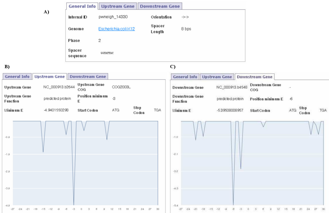
Figure 4 Study of the location of the SD sequence between a co-directional gene pair. Compilation of images that the users can find when they are studying the location of the SD sequence between the co-directional genes NC_000913.b2644 and NC_000913.b4548 separated by 8 bps. General Info label gives details about the spacer between this gene pair, which include the Spacing length and the Spacer sequence (A). The NC_000913.b2644 Upstream Gene label gives information about this gene (B), while the NC_000913.b4548 Downstream Gene label gives information about this gene as well as SD related information and the corresponding graph of the \Delta G^\circ values along the translation initiation region (C).