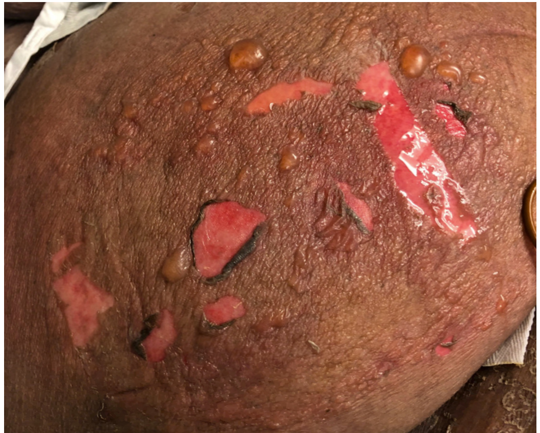
FIGURE 1: Bullae and positive Nikolsky's sign on the lateral aspect of the patient's right thigh one day after admission

The patient arrived at our hospital in severe respiratory distress concomitant with blistering dermatological lesions. Given that treating the patient in the burn unit requires exposure to an immunocompromised patient population, a decision was made to place the patient in the surgical intensive care unit (SICU) for PUI protocol in a negative pressure room. The patient's initial exam under standard COVID-19 airborne precautions revealed 5% total body surface area of epidermal loss affecting bilateral thighs, bilateral arms, and face (Figure 1).