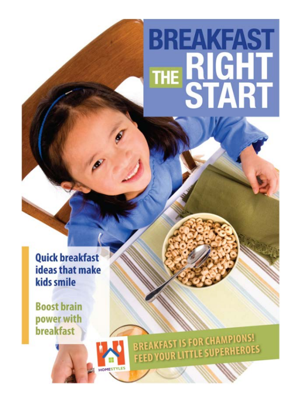
Figure 1. Example guide showing cover lines.

The designs were reviewed by the writing team, refined, and then subjected to Design Cognitive Testing. In addition, the cover design presented the opportunity to incorporate cover lines on the cover page. Cover lines (sometimes called headlines) are short phrases on magazine covers designed to stimulate reader interest [252–255]. The writing team created cover lines for each guide and evaluated the extent to which mothers of young children (n = 77) felt each cover line motivated them to read a short magazine article [256]. The cover lines rated as most motivating were added to the guide covers (Figure 1).